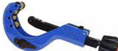
70002 Quick Action Tubing Cutter 1/4" to 2-1/2" (6 to 62 mm) O.D.