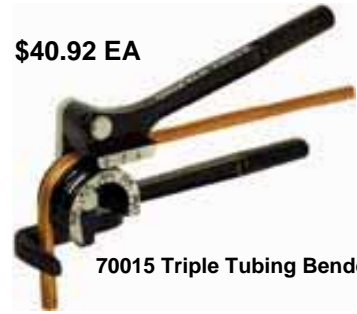
70015 Triple Tubing Bender