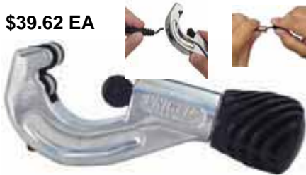
70090 Premium Tubing Cutter with Retractable Deburring Blade 5/16" to 1-5/8" (8mm to 42mm) O.D.