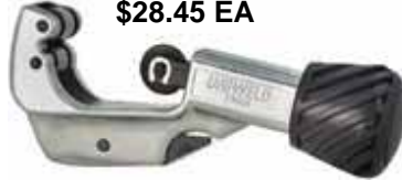
70001 Premium Tubing Cutter 1/8" to 1-1/4" (3mm to 32mm) O.D.