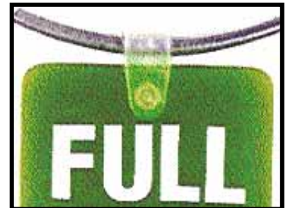
Part No. T-25-P

T-15-P One Sided Empty T-25-P One Sided Full T-35-P Two Sided, Empty on one side Full on the other