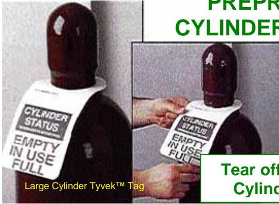
Large Cylinder Tyvek™ Tag