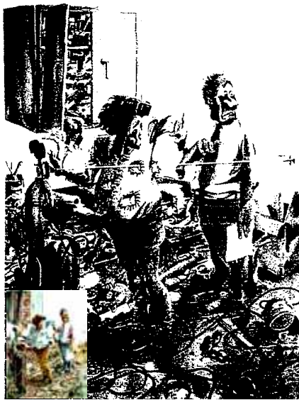
1 "I never release the adjusting screw, takes too much time. Oops!" Safety Rule: Always release regulator adjusting screw before opening valve.