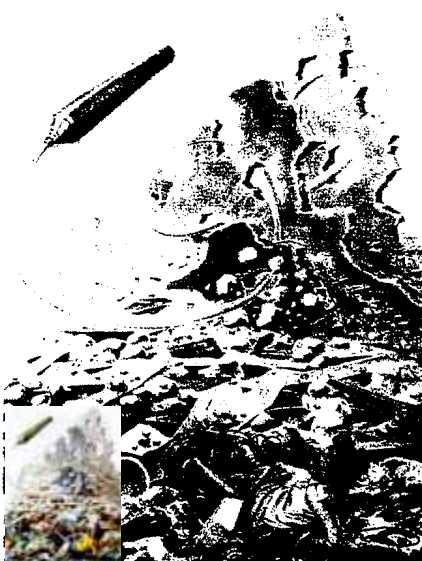
4 "Blast! I must have forgotten to chain my oxygen cylinder." Safety Rule: Secure and locate all cylinders to prevent them from falling, dropping or being knocked over.