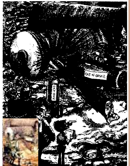
6 "There goes Lumis now... and his theory on using oxygen for ventilation." Safety Rule: Never use oxygen as a substitute for compressed air.