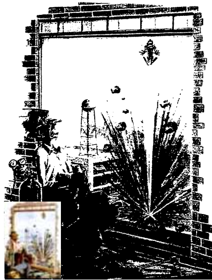
2 "I told you, some of the welders were using oil on their regulators." Safety Rule: Never use oil or petroleum base grease on regulators, inlet and outlet connections, cylinder valves, torches, fittings or other equipment in contact with oxygen.