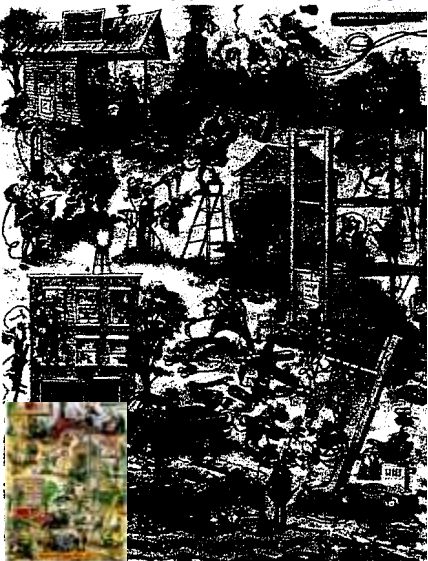
5 Can you see the 37 (or more) safety violations shown here? Safety Rule: Know and follow all safety rules and practices during welding, heating and cutting operations.