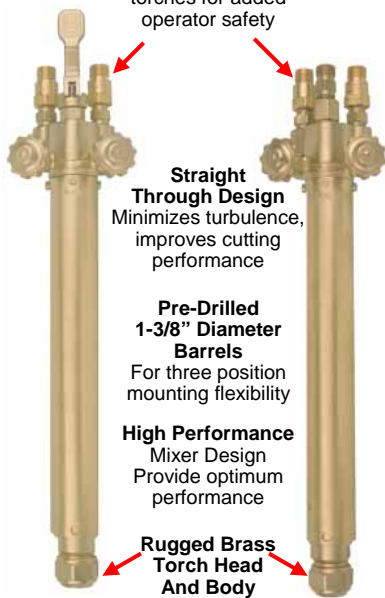
MT 200 SERIES

Accessory Reverse Flow Check Valves Supplied with all machine torches for added operator safety