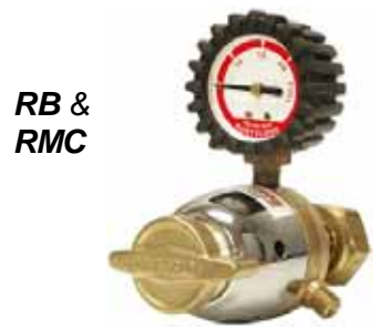
RB & RMC

Adaptor F58L (Left hand), Converts regulator outlet from "A" to "B" hose connection