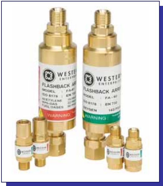
Color Coded for easy Identification

A backfire or flashback occurs when mixed gases are ignited in the torch, hose or regulator. Flashback arrestors are designed specifically to help prevent and stop these dangerous situations by preventing reverse flow of gases and quenching backfires and flashbacks at the torch or regulator.