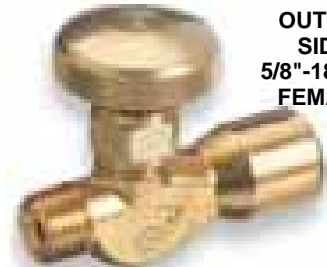
OUTLET SIDE 5/8"-18 R.H. FEMALE