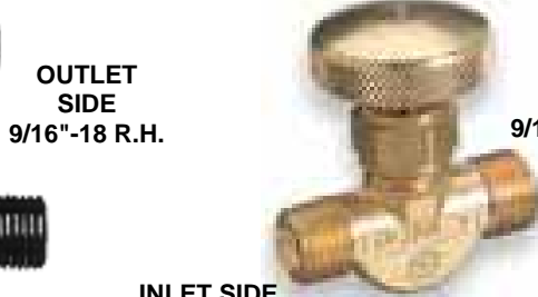
OUTLET SIDE 9/16"-18 R.H.