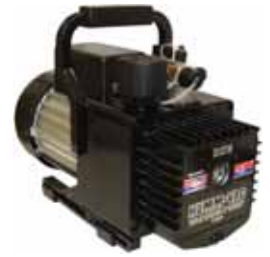
With Large Oil Sight Glass