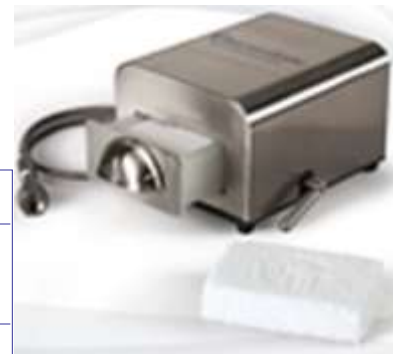
#560 Stainless Steel Construction