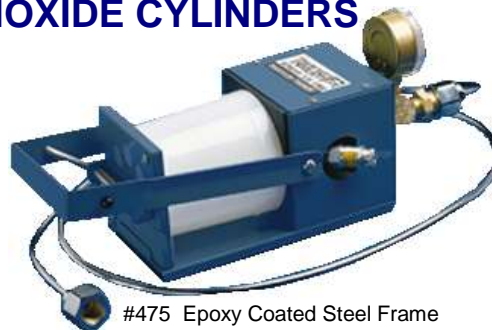
#475 Epoxy Coated Steel Frame

Use only in a well ventilated area with proper safety apparel including, but not limited to, gloves and eye protection.