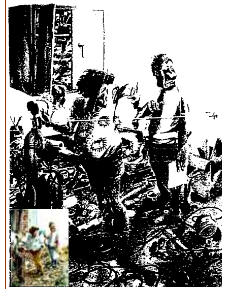
"I never release the adjusting screw, takes too much time. Oops!" Safety Rule: Always release regulator adjusting screw before opening valve.