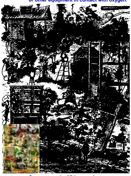
Can you see the 37 (or more) safety violations shown here? Safety Rule: Know and follow all safety rules and practices during welding, heating and cutting operations.