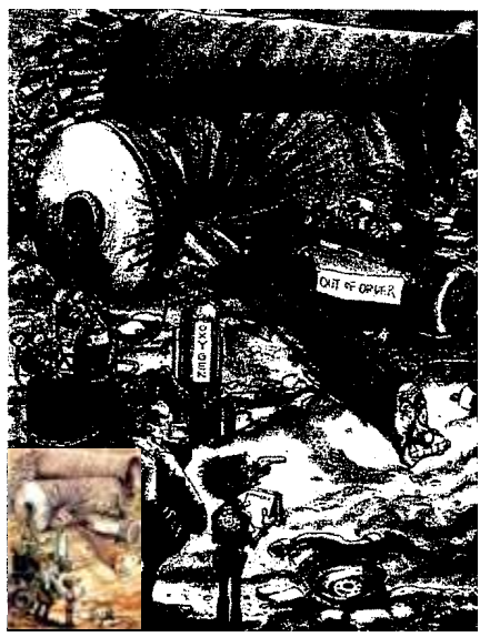
"There goes Lumis now... and his theory on using oxygen for ventilation." Safety Rule: Never use oxygen as a substitute for compressed air.