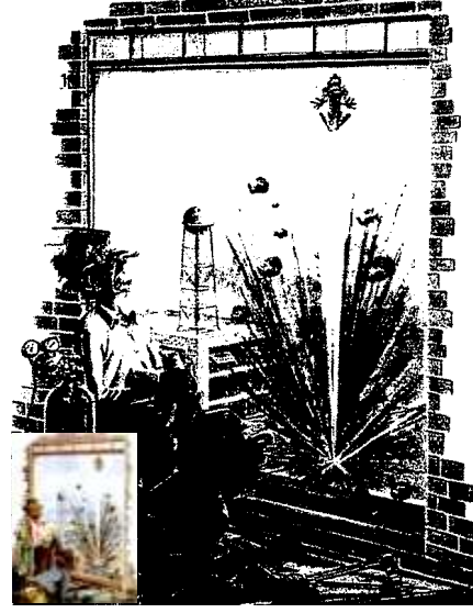
"I told you, some of the welders were using oil on their regulators." Safety Rule: Never use oil or petroleum base grease on regulators, inlet and outlet connections, cylinder valves, torches, fittings or other equipment in contact with oxygen.