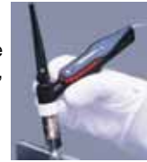
Remote Control, Rotary (CALL)

The Amtrak remote current control provides remote off-on control of the welding machine contactor and / or gas and water solenoid control, as well as full range remote current output control. A built-in strain-relief prevents the control cord from being pulled out or damaged. The Amtrak remote current control can be ordered either built into a TIG torch replacement handle or as a clip-on unit for retrofit to existing TIG torches or SMAW (stick) electrode holders, or in the velcro model where one size fits all.