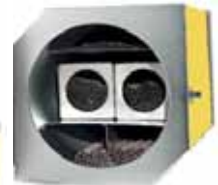
Bench Version of Type 15 Shown End View (open)